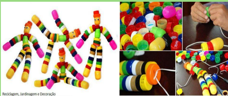
Reciclagem, Jardinagem e Decoração